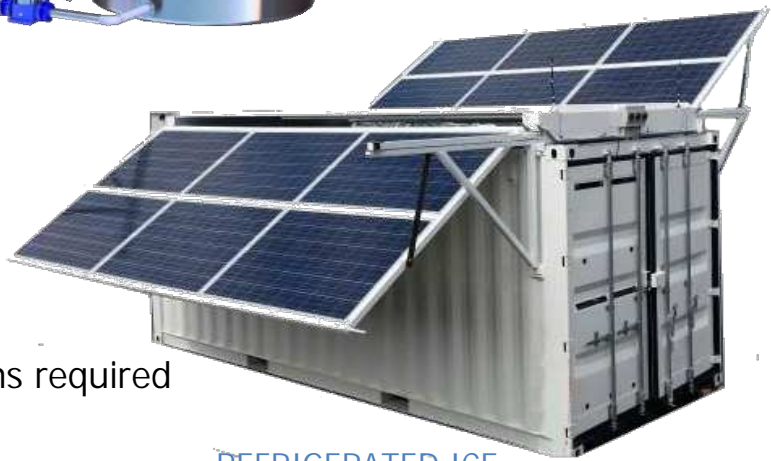
REFRIGERATED ICE BANK