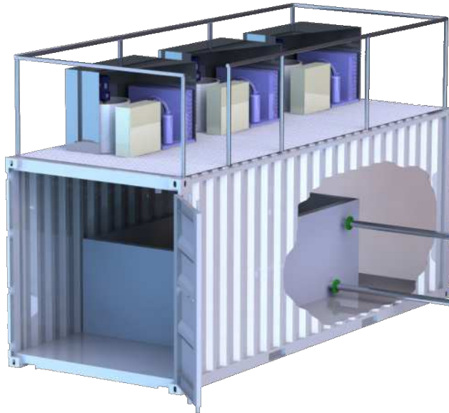
MILK VAT CHILLER WITH ICE MAKER

Delivered containerized or "flat packed" for site assembly, Heuch Solar Powered Ice Makers produce and store ice during daylight hours for use anytime.